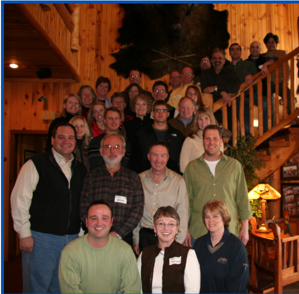
Prairie Family Business Retreat Winter 2008

"The retreat helped us by providing a way to handle conflicts among family members, it also gave us helpful information to strengthen the Family Business and the FAMILY." Past Participant